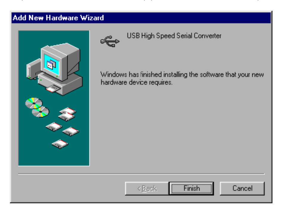
Step 6: Verify that a USB virtual COM port was installed correctly by viewing the ports section of the Device Manager tab located in System Properties | Device Manager | Ports.