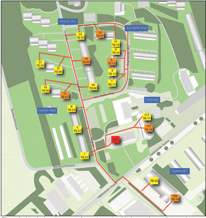
Figure 2. A typical environment of an urban grip with the maximum distance between nodes at 20m. Installation of one access node in a substation and installation of 22 nodes at one customer's premises.